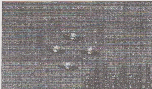
Computer art by Victor Lourenco

When Carol (17 or 18 yrs old) was driving by Iona Station area on Highway 3, she sighted a large, bright light hovering in the sky.